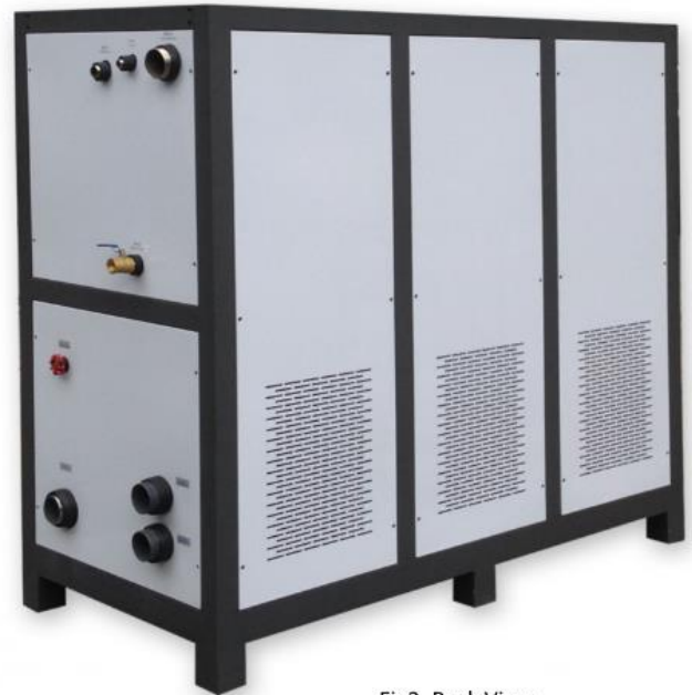
Fig2. Back View