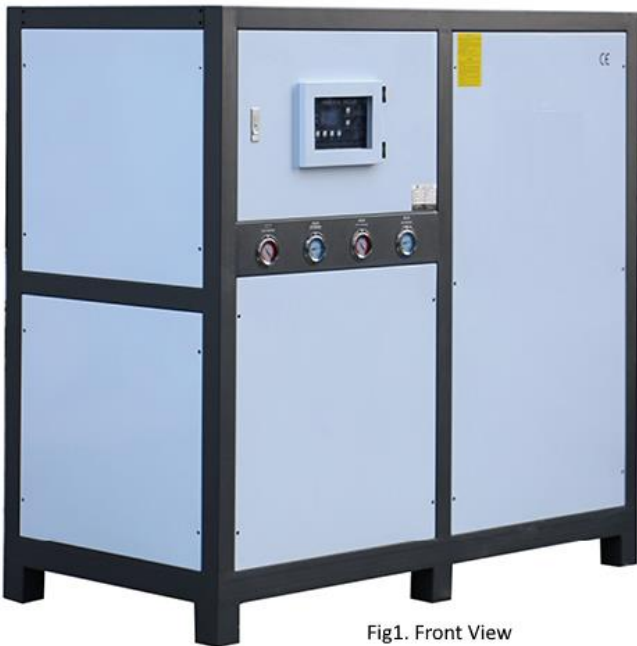
Fig1. Front View